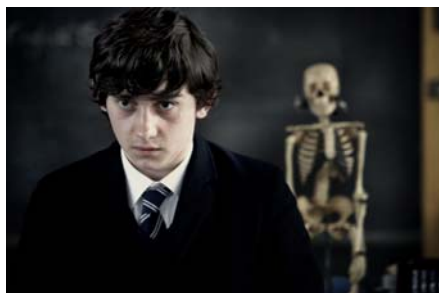
Photo: Craig Roberts as Oliver Tate in Submarine