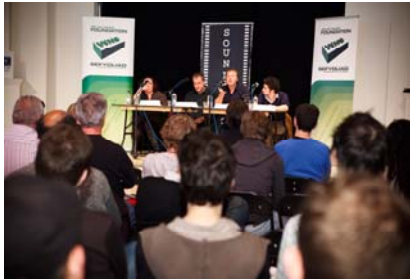
Photo: Delegates at the 'All The Right Mov(i)es : Getting your music in film and TV'

On Friday 20 th November 2009 Welsh Music Foundation held an event as part of Soundtrack International Film Festival entitled 'All The Right Mov(i)es : Getting your music in film and TV', a free seminar at The Gate, Roath, Cardiff. With music synchronisation