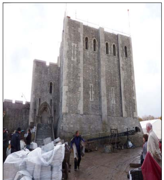
Photo: Replica of Rochester Castle purpose built on the Dragon Studio Site for the film Ironclad

A spokesperson for the Wales Screen Commission said: "It's the first time, certainly since the Commission has been going that a film on this scale has been based entirely here in Wales. We're used to high profile productions coming over and using the fabulous locations that Wales is famous for, but only for one or two weeks at the most, then they go back to London for the studio space they require for their sets. The opportunity has finally opened up for other larger scale productions to be based here in South Wales."