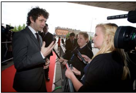
Michael Sheen on the red carpet at the BAFTAs 2009

School children from Porth School were the star at the Welsh BAFTA's held on 17 May when they interviewed film star Michael Sheen.