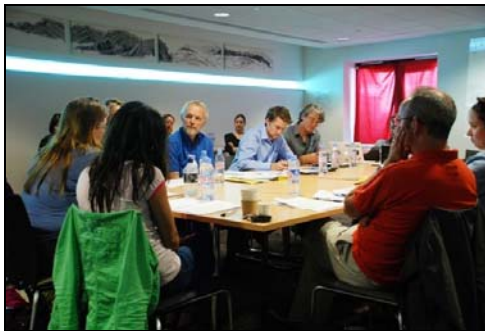
Delegates at the Sheffield Documentary workshop

The intense couple of days in Cardiff culminated in participants pitching to visiting commissioners; Jo Lapping from Storyville (BBC) and Aysha Rafaele from Channel Four. The feedback from commissioners was very illuminating and they expressed interest in following up a number of the pitched proposals.