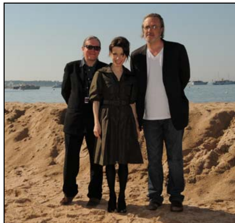
Producer Stephen Woolley, director Nigel Cole and actress Sally Hawkins promoting the film in Cannes.

The South East office of the Wales Screen Commission has been working on the feature film Dagenham Girls which got underway at the Hoover site in Merthyr Tydfil at the end of June.